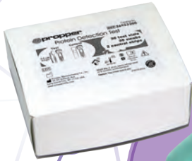
ProExpose™ Protein Detection Test Kit Cat. No.: 26923300